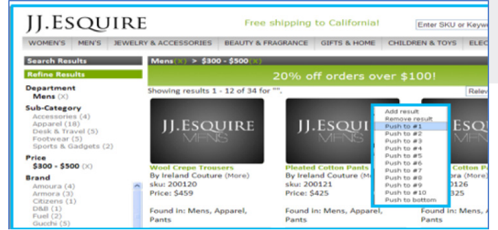
Search&Promote Visual Rule Builder can fix the position of a product on your results

builder, click product ABC and make it #1. Save, 'push the change live', and after 3 seconds the Rule is Live. Done! Move on to your next business requirement!